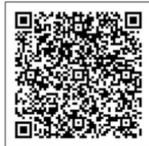
All Saints Day Parish Picnic